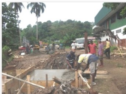
Site clearance for the commercial building.

The Diocese of Gizo will soon have a new Commercial building here in Gizo- in the China town area.